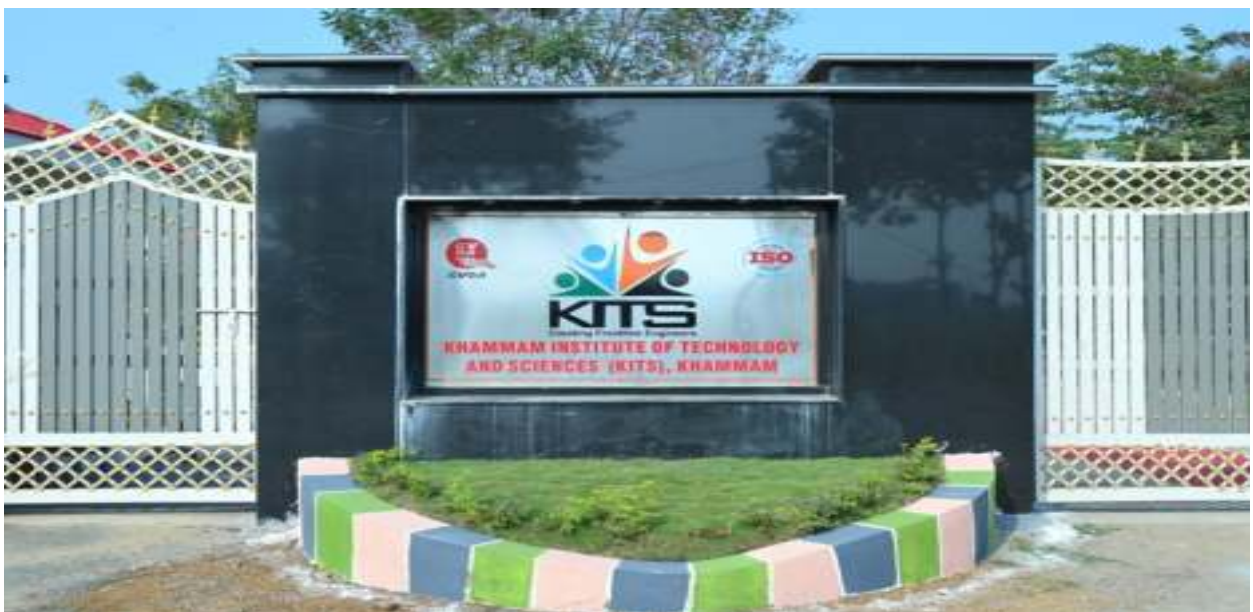
KITS SECIRITY CHECK POINT