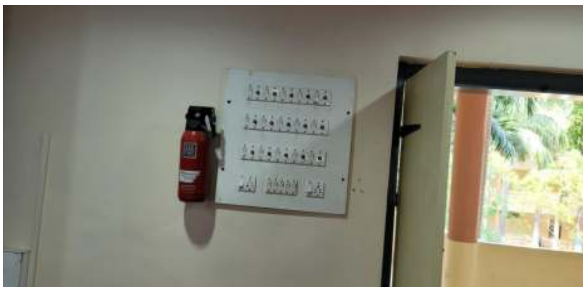
Fire extinguishers available in whole campus