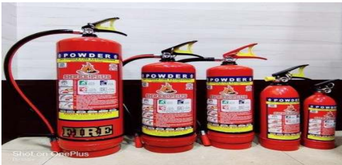
Fire extinguishers available in whole campus